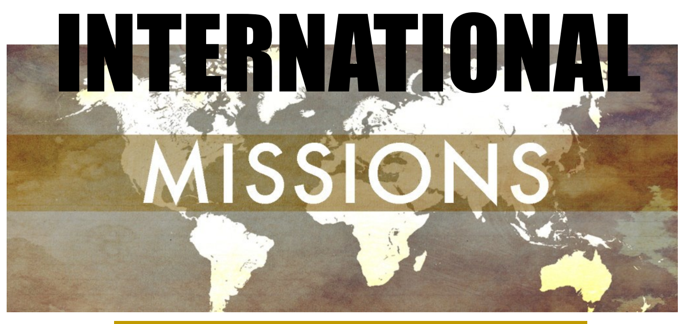
North American Mission Board – December Lottie Moon

100% of your gifts through your church's Lottie Moon Christmas Offering ® fund ministry overseas. More information and downloadable resources, including videos, presentation slides and social media graphics, are available at <u>imb.org/lmco</u>.