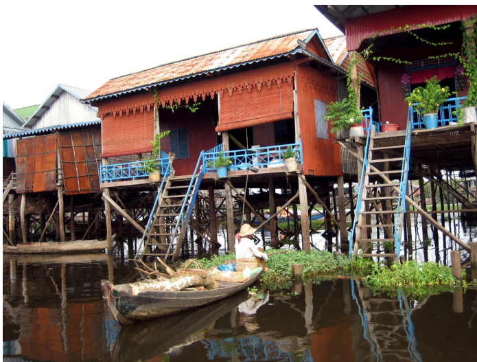
Photo from the floating villages on Tonle Sap Lake