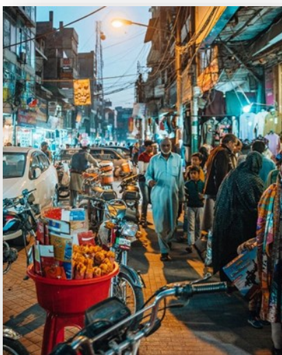
Lahore Pakistan Bazaar