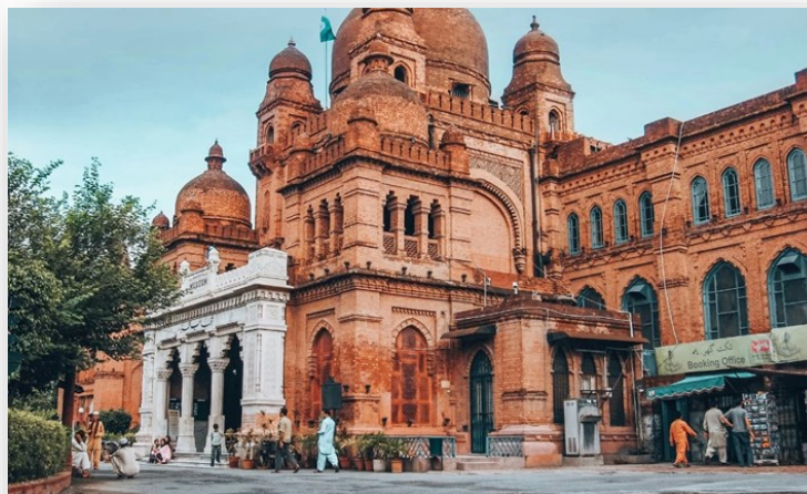
Lahore Pakistan Historical Museum