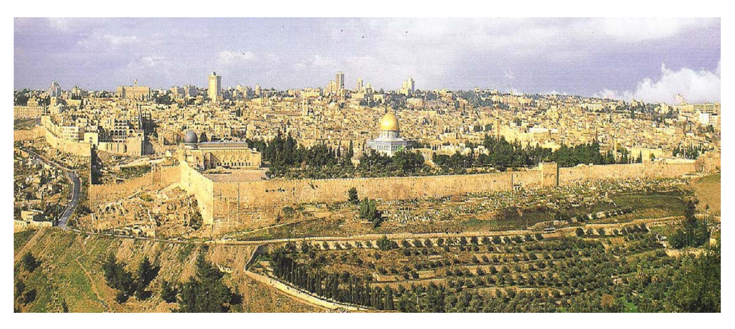
A view of Jerusalem as seen from the Mount of Olives